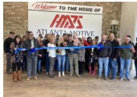
Atlanta Motive Power Services (AMPS) Chooses Lamar

BARNESVILLE- Atlanta Motive Power Service LLC , a sales and service provider for industrial batteries and chargers, announced it will open its new Barnesville operation in a new 20,000 sq. ft. building in Legacy Industrial Park off Hwy. 41.